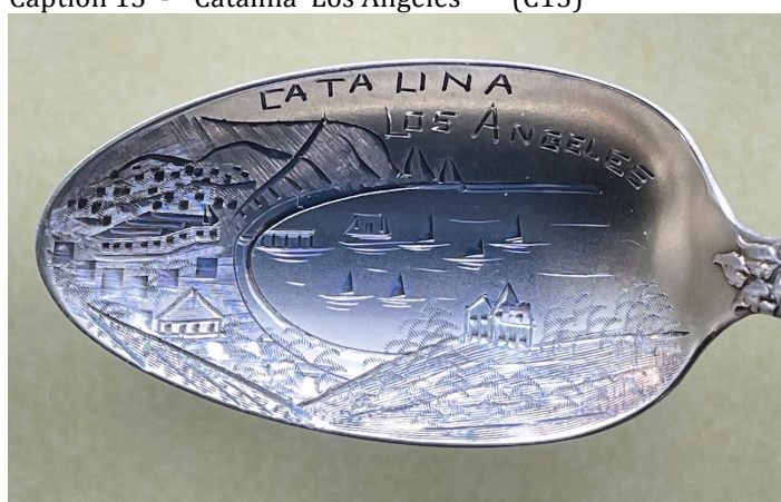
on Wallace Rose pattern (same scene/engraver as C1-V1a)